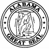
Fob James, Jr. Governor